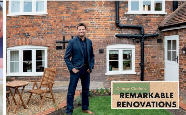
George Clarke's REMARKABLE RENOVATIONS