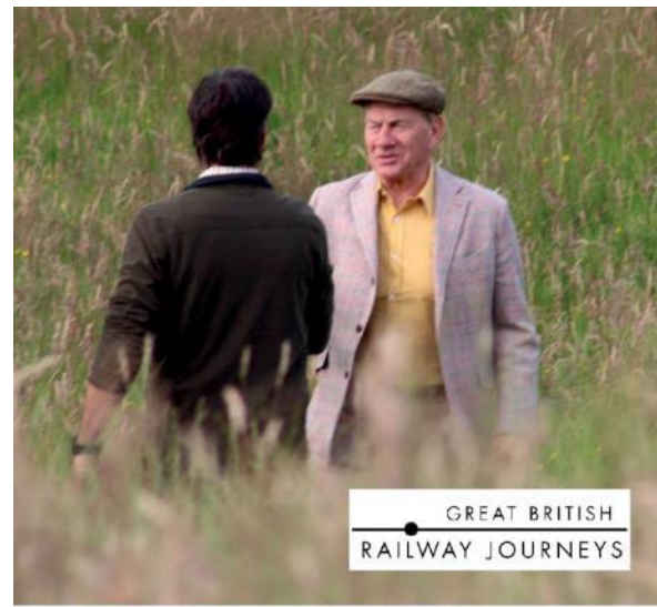
GREAT BRITISH RAILWAY JOURNEYS