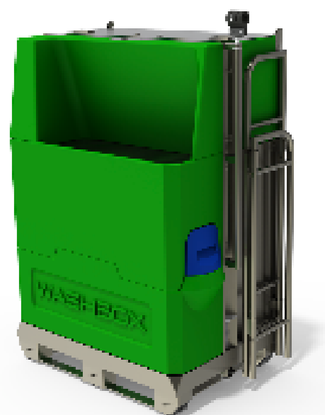
Trolley version for small construction and fitout

The Washbox closed loop, mobile wash station is suitable for all fitout trades and designed to tackle water waste head on. Operating independently from water and sewer systems, Washbox conserves water, reducing consumption by over 98%.