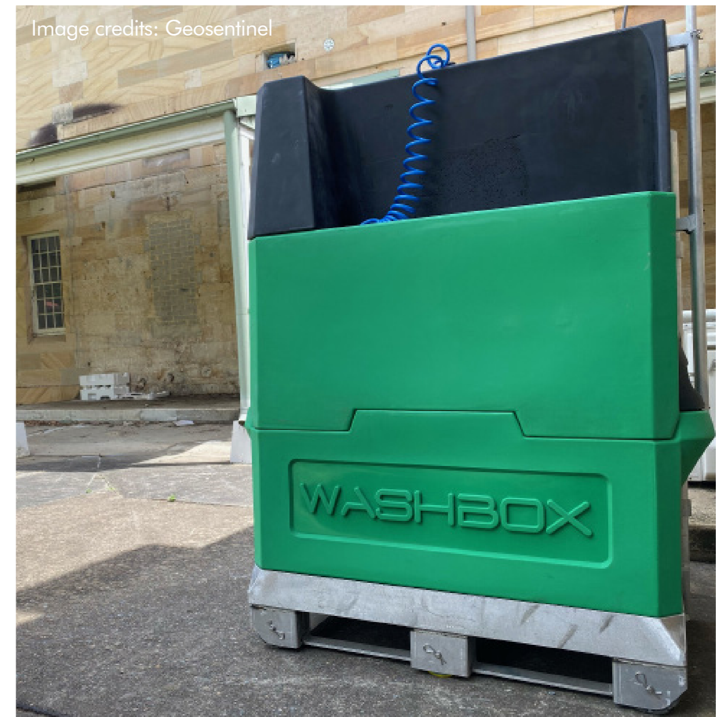
The world's most productive Zero Liquid Discharge (ZLD) tool wash station