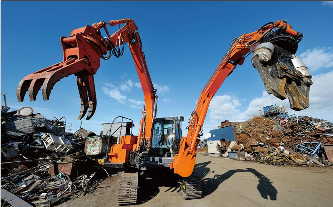
Hitachi ASTACO (Advanced System with Twin Arm for Complex Operation)

Increased automation was also cited as a barrier to reuse by steelwork fabricators. Many UK fabricators have or are currently investing in fully automated production lines that cut, drill and in some cases weld, structural steel members. Recovered sections will generally include holes/openings and plates, brackets, stiffeners, etc. welded to the main member. Automated fabrication lines will not cope well with these unforeseen additions and therefore manual removal of accessories will be required; incurring additional cost and impeding factory throughput.